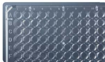
Special lid design ensures low evaporation