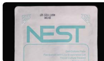
Lot No. for traceability