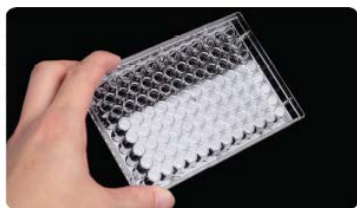
Excellent bottom uniformity