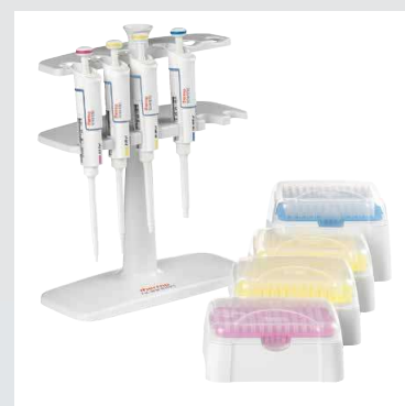
Finnpipette F1 GLP kit 1