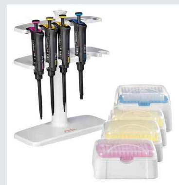
Finnpipette F2 GLP Kit 2