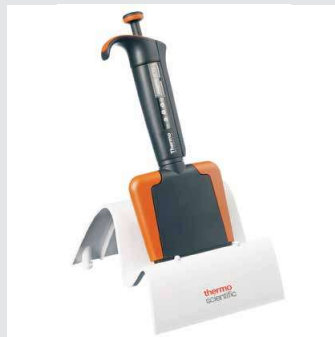
Multichannel Pipette Stand