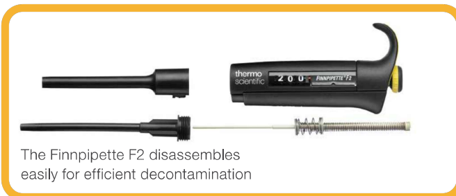
The Finn timer F2 disassembles easily for efficient decontamination

Maintenance is easy: simply detach the tip cone for efficient daily maintenance or decontamination when not using an autoclave